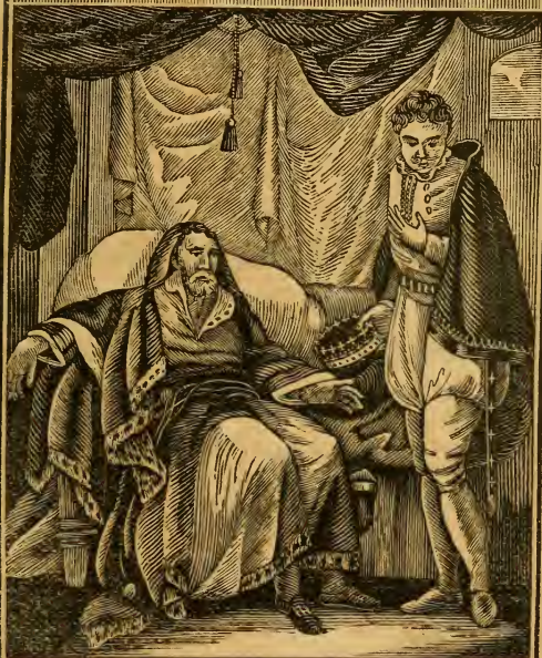
HENRY IV. & PRINCE OF WALES.